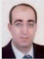
Abdelfattah Sadakah Tanta, Egypt